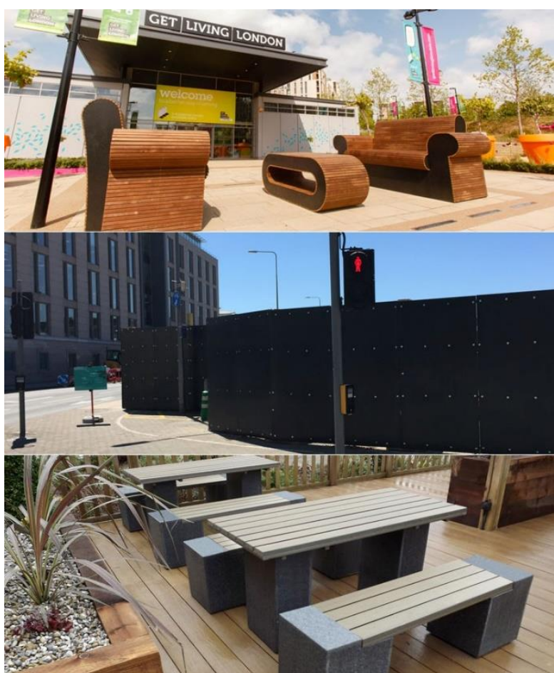
Fig. 3. Example applications of EKOPly boards.