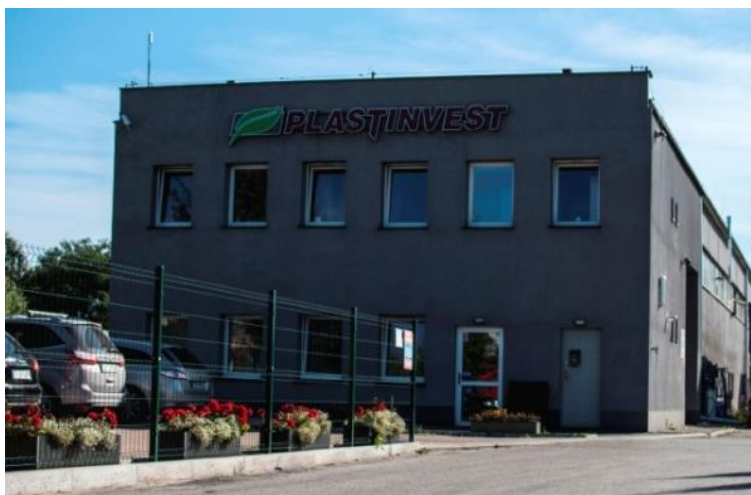
Fig. 1. Plastinvest Sp. z o.o. manufacturing plant located in Suchedniów (Poland).

PLASTINVEST Sp. z o.o. produces EKOpoly board which nearly consists of 99% of recycled material. EKOpoly is a product made entirely in recycling technology. EKOpoly manufacturer - Plastinvest was established in 2011 and decided to invest in a processing line that complements the philosophy of processing waste plastics and create entirely new products. EKOpoly board covers different building applications including: insulation of pitched roof, agriculture, small architecture, shoring, roof and floor covering. Manufacturing building is shown in Fig. 1.