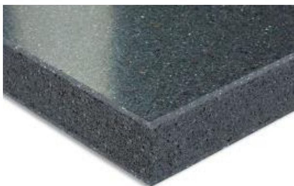
Fig. 2. An example of the EKOpoly board produced by Plastinvest Sp. z o. o.

EKOpoly boards made in recycling technology are resistant to moisture, water, most of chemical substances as well as UV radiation. EKOpoly boards are intended for the exterior and interior applications, in the various branches of the industry such as construction, furniture or agriculture. The products are made by means of thermal bonding and forming of secondary raw materials – polyethylene (PE) and polypropylene (PP) – as unified with distinctly isolated outer layers (skin) and the inner layer (core). EKOpoly STANDARD ANTI-SLIP 20 is a product possessing antislip surface layer on one side. The boards are available in three different colours: Grey (standard), Blue and Green. An example of EKOpoly STANDARD 19 is shown in Fig. 2. The specification of the product is presented in Table 1.